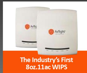
The Industry's First 802.11ac WIPS