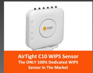
AirTight C10 WIPS Sensor The ONLY 100% Dedicated WIPS Sensor In The Market