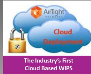
The Industry's First Cloud Based WIPS