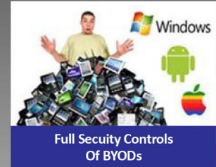
Full Security Controls Of BYODs